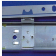
Can be easily removed